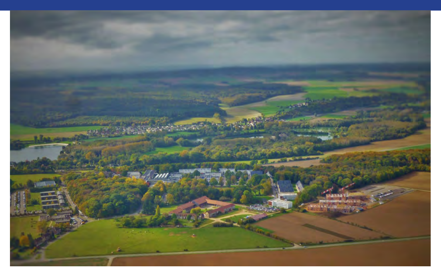
The Beauvais campus focuses on agronomy and agro-industry, food and health, and geosciences and the environment.

Located just over 3 km from Beauvais town centre (15 minutes by bus), the Beauvais campus offers students and employees exceptional living and working conditions: wooded landscape, application fields, accommodation, university restaurant and sports facilities are all directly accessible on site.